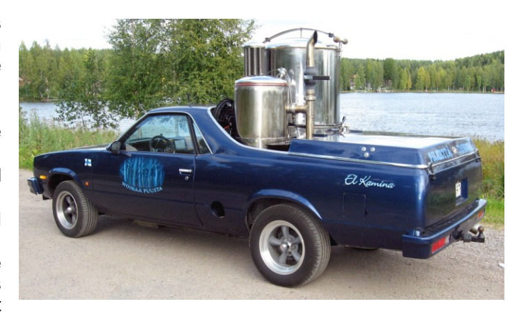
Super charged Chevrolet El Camino (renamed El Kamina), Finland

BOOK IS CONFIDENTIAL AND DELIVERED FOR PERSONAL USE ONLY AVAILABLE AS AUTHOR'S EDITION