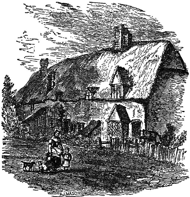
MOTHER SHIPTON'S HOUSE