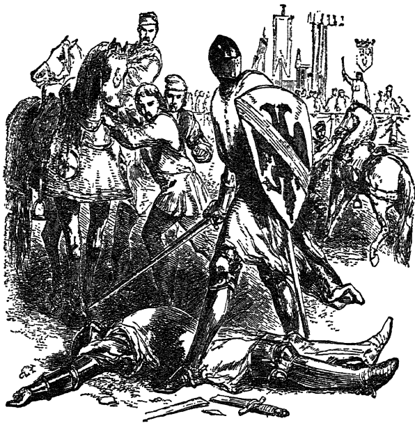
FIGHT BETWEEN DU GUESCLIN AND TROUSSEL