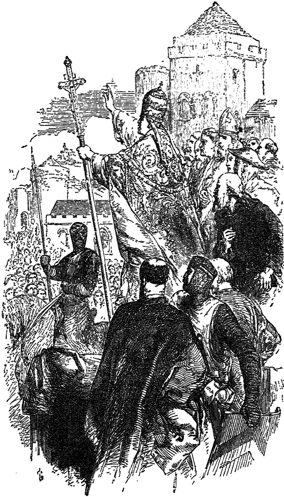
POPE URBAN PREACHING THE FIRST CRUSADE