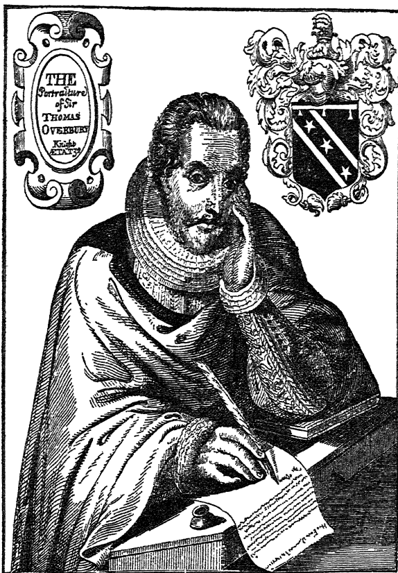
SIR THOMAS OVERBURY