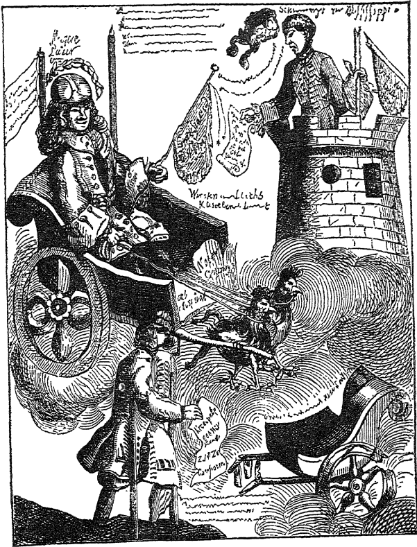
LAW IN A CAR DRAWN BY COCKS